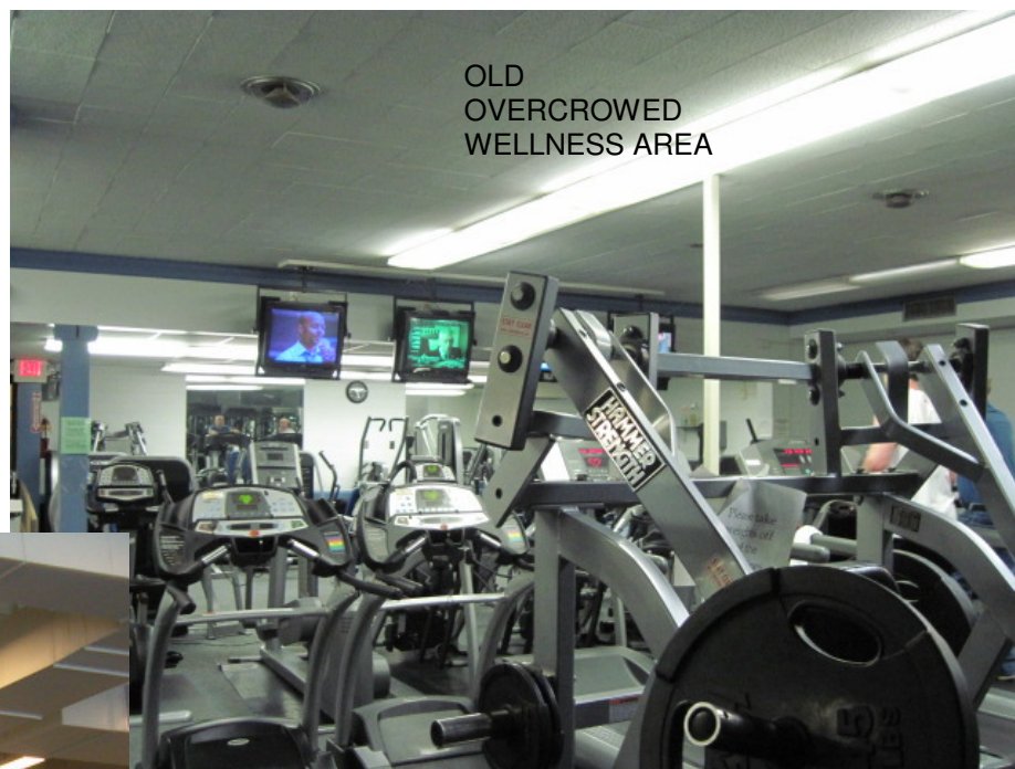
OLD OVERCROWDED WELLNESS AREA