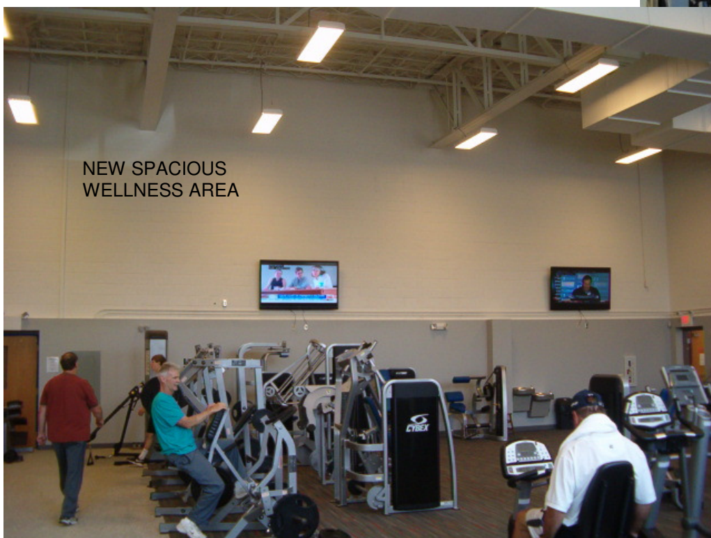
NEW SPACIOUS WELLNESS AREA