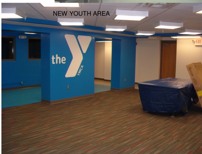
NEW YOUTH AREA

Architect: SoL Harris/Day Architecture 6677 Frank Avenue NW, North Canton, Ohio 44720 p. 330.493.3722